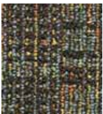
421 HOT SHOT