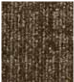
101 BEACH GLASS

Style Number .....GT069 Style Name .....Centered Modular Collection.....Now and Zen Construction .....tufted Surface Texture.....textured patterned cut and loop Gauge ..... 1/12 (47.00 rows per 10 cm) Density.....9,249 Weight Density ..... 207,438 Sustainable Content ... Contains a minimum 35% pre-consumer recycled content by total weight Stitches Per Inch..... 11.4 per inch (44.8/10 cm) rev 1/06 Protective Treatment... DuraTech Finished Pile Thickness...084" (2.13 mm) Dye Method..... solution dyed/yarn dyed Backing Material..... EcoFlex ICT Fiber Type ..... Duracolor® Premium Nylon with Antron® Legacy Fiber Technology ..... Duracolor® by LEES Stain Resistant System. Passes GSA requirements for permanent stain resistant carpet. Face Weight..... 22 oz/yd2 (746.02 gm/m2) Antimicrobial ..... Bioguard® by Lees Size/Width ..... 24" x 24" (60.9 cm x 60.9 cm) Installation Method..... quarter turn, monolithic IAQ Green Label Plus.. 1098 CRI Rating..... Severe Traffic Pattern Repeat ..... Not Applicable Warranties ..... Lifetime Limited Modular Warranty, Lifetime Duracolor Stain Warranty, Lifetime Static