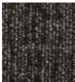
227 BLUE GROTTTO