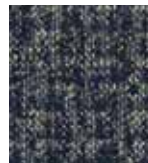
317 BALTIC GREEN