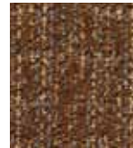
204 SAND CASTLE