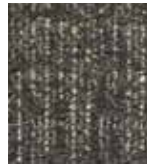
108 GREY DAWN