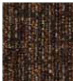
303 AUTUMN HARVEST