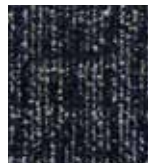
307 BLUE STREAM