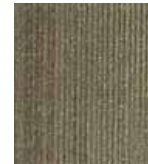
231 INDUSTRIAL PATINA