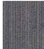
217 LASTING IMPRESSION