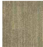
201 ALLURING ORIGINS