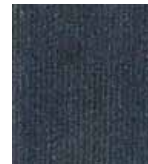
537 CHERISHED RUINS