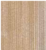
114 ORGANIC MOIRE

Style Number .....GT106 Style Name.....DesignConnect II Modular Collection .....Abaca II Construction .....tufted Surface Texture.....textured patterned loop Gauge .....1/12 (47.00 rows per 10 cm) Density .....5,950 Weight Density.....119,000 Sustainable Content.....Contains a minimum 35% pre-consumer recycled content by total weight Stitches Per Inch .....9.4 (37.01 per 10 cm) Protective Treatment.....DuraTech Finished Pile Thickness......121 (3.07 mm) Dye Method.....solution dyed/yarn dyed Backing Material .....EcoFlex ICT Fiber Type .....Duracolor® Premium Nylon with Antron® Legacy Fiber Technology .....Duracolor® by LEES Stain Resistant System. Passes GSA requirements for permanent stain resistant carpet. Face Weight .....20 oz/yd2 (678.2 gm/m2) Size/Width.....24" x 24" (60.9 cm x 60.9 cm) Installation Method .....quarter turn, vertical ashlar, brick ashlar, monolithic, multi-directional IAQ Green Label Plus.....1098 CRI Rating.....Heavy Traffic Pattern Repeat.....Not Applicable Warranties ..... Lifetime Limited Modular Warranty, Lifetime Duracolor Stain Warranty, Lifetime Static