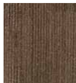
344 NATURAL PERFECTION