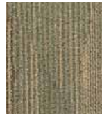
201 ALLURING ORIGINS