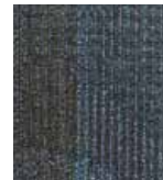
537 CHERISHED RUINS