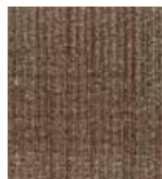
344 NATURAL PERFECTION