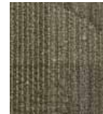
231 INDUSTRIAL PATINA