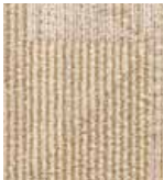
114 ORGANIC MOIRE

Style Number .....GT105 Style Name .....DesignScene II Modular Construction .....tufted Surface Texture .....textured patterned cut & loop Gauge .....1/12 (47.00 rows per 10 cm) Density .....6,372 Weight Density .....127,440 Sustainable Content ..Contains a minimum 35% pre-consumer recycled content by weight Stitches Per Inch .....9.5 (37.40 per 10 cm) Protective Treatment ..DuraTech Finished Pile Thickness....113" (2.87 mm) Dye Method .....solution dyed/yarn dyed Backing Material .....EcoFlex ICT Face Yarn .....Duracolor® Premium Fiber with Antron® Legacy Fiber Technology .....Duracolor® by LEES Stain Resistant System. Passes GSA requirements for permanent stain resistant carpet. Face Weight .....20 oz/yd2 (678 g/m2) Size/Width .....24" x 24" (60.9 cm x 60.9 cm) Installation Method ....quarter turn, vertical ashlar, brick ashlar, monolithic, multi-directional IAQ Green Label Plus..1098 CRI Rating .....Heavy Traffic Pattern Repeat .....Not Applicable Warranties .....Lifetime Limited Modular Warranty, Lifetime Duracolor Stain Warranty, Lifetime Static