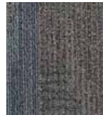
217 LASTING IMPRESSION