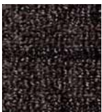
428 LOWER EAST SIDE