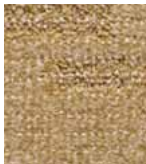
116 PAL- VENICE BEACH