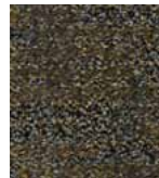
311 SHENANDOAH VALLEY