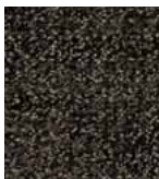
501 CENTRAL PARK