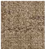
101 PACIFIC ISADES

Style Number ..... GL038 Style Name ..... Destination Collection..... Sojourn Construction ..... tufted Surface Texture ..... textured multicolored loop Gauge ..... 1/12 (47.00 rows per 10 cm) Density ..... 6,261 Weight Density ..... 150,264 Stitches Per Inch ..... 11.7 per inch (46.06/10 cm) Finished Pile Thickness .138" (3.51 mm) Dye Method ..... yarn dyed Backing Material ..... Unibond Flex Face Yarn ..... Antron® Legacy Nylon with DuraTech Soil Protection by Invista Fiber Technology ..... Duracolor® by LEES Stain Resistant System. Passes GSA requirements for permanent stain resistant carpet. Face Weight ..... 24.0 oz/yd2 (814 g/m2) Size/Width ..... 12' width (3.66 m) IAQ Green Label Plus.. 4952 Pattern Repeat ..... 9" (W) x 22.25" (L) Warranties ..... Lifetime Limited Unibond Flex Warranty, Lifetime Duracolor Stain Warranty, Lifetime Static