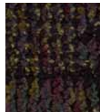
428 MOUNTAIN BEAUTY