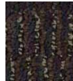
304 EARTHLY TAUPE