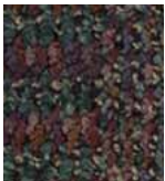
401 DELTA GREEN