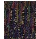
507 INDIA INK