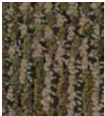
204 SAND DUNE

Style Number .....DH336 Style Name .....Flamestitch II Collection.....Workplace Construction .....tufted Surface Texture .....textured patterned loop Gauge .....1/12 (47.00 rows per 10 cm) Density .....5,110 Weight Density .....112,420 Sustainable Content ..Contains minimum 20% post consumer- .....recycled content by total product weight Stitches Per Inch .....8.9 per inch (35.03/10 cm) Finished Pile Thickness .155" avg (3.9 mm) Dye Method .....yarn dyed Backing Material .....Unibond Flex Face Yarn .....Antron® Legacy nylon 6,6 with DuraTech .....Soil Protection by DuPont Fiber Technology .....Duracolor® by LEES Stain Resistant System. .....Passes GSA requirements for permanent .....stain resistant carpet. Face Weight .....22 oz/yd2 (746.02 gm/m2) Size/Width .....12' width (3.66m) IAQ Green Label Plus..4952 Pattern Repeat .....18" W x 16" L Warranties ..... Lifetime Limited Unibond Flex Warranty, Lifetime Duracolor Stain Warranty, Lifetime Static