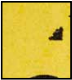
406 HIGH BEAMS

Style Number .....GT059 Style Name.....Headlights Modular Construction .....tufted Surface Texture.....textured patterned cut & loop Gauge .....1/8 (31.50 rows per 10 cm) Density .....6,776 Weight Density.....216,832 Sustainable Content.....Contains 10% post consumer and 2& bio-based content based on total product weight Stitches Per Inch .....14.0 per inch (55.12 per 10 cm) Protective Treatment.....Averta Stain Protection Finished Pile Thickness .....170" (4.32 mm) Dye Method.....printed Backing Material .....EcoFlex Air Face Yarn.....Fortis Nylon Face Weight .....32.0 oz/yd2 (1085.12 g/m2) Size/Width.....24" x 24" (60.9 cm x 60.9 cm) Installation Method .....monolithic, quarter turn IAQ Green Label Plus.....2692 CRI Rating.....Severe Traffic Pattern Repeat.....Not Applicable Warranties.....Lifetime Limited Modular Warranty, Lifetime Static