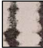
438 EURO LIGHTS