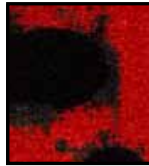
433 PROJECTOR LIGHTS