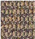
204 SAND DUNE

Style Number ..... D8446 Style Name ..... Heartland Collection..... Workplace Construction ..... tufted Surface Texture ..... textured graphic loop Gauge ..... 5/64" (50.4/10 cm) Density ..... 6,887 Weight Density ..... 151,514 Stitches Per Inch ..... 10.8 per inch (42.52/10 cm) Finished Pile Thickness .115" avg (2.9 mm) Dye Method ..... yarn dyed Backing Material ..... Unibond Flex Face Yarn ..... Antron® Legacy nylon 6,6 with DuraTech Soil Protection by DuPont Fiber Technology ..... Duracolor® by LEES Stain Resistant System. Passes GSA requirements for permanent stain resistant carpet. Face Weight..... 22 oz/yd2 (746.02 gm/m2) Size/Width ..... 12' width (3.66 m) IAQ Green Label Plus.. 4952 Pattern Repeat ..... .50" (W) x .50" (L) Warranties ..... Lifetime Limited Unibond Flex Warranty, Lifetime Duracolor Stain Warranty, Lifetime Static