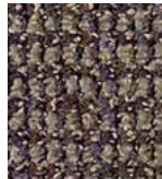
221 ASH GREEN