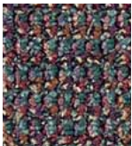
401 DELTA GREEN