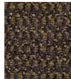
444 BROWN TONES