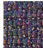
507 INDIA INK