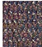
304 EARTHLY TAUPE