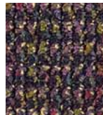
428 MOUNTAIN BEAUTY