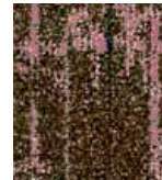
304 DAPPLED GRADIENT