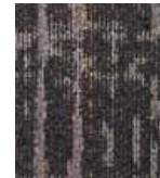
308 ALTERED STATE