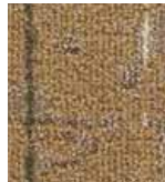
206 REFLECTIVE SYNERGY