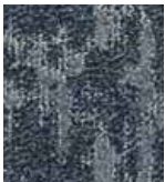
327 STATIC ILLUSION