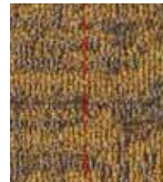
226 SOLARIZED PATH