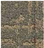
101 TRANSIENT COLOR

Style Number .....GT097 Style Name .....Integrated Circuit Modular Construction .....tufted Surface Texture .....textured patterned cut and loop Gauge .....1/12 (47.00 rows per 10 cm) Density .....6,828 Weight Density .....150,216 Stitches Per Inch .....11.4 per inch (44.88 per 10 cm) Protective Treatment...DuraTech Finished Pile Thickness .116" (2.95 mm) Dye Method .....solution dyed/yarn dyed Backing Material .....EcoFlex ICT Fiber Technology .....Duracolor® by LEES Stain Resistant System. .....Passes GSA requirements for permanent .....stain resistant carpet. Face Weight .....22 oz/yd2 (746.02 gm/m2) Size/Width .....24" x 24" (.6096 m x .6096 m) Installation Method ....monolithic, vertical ashlar, brick ashlar, .....quarter turn IAQ Green Label Plus..1098 CRI Rating .....severe traffic Pattern Repeat .....Not Applicable Warranties ..... Lifetime Limited Modular Warranty, Lifetime Duracolor Stain Warranty, Lifetime Static