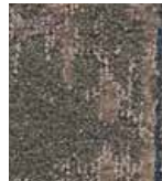
208 MULTIFACETED FORMAT