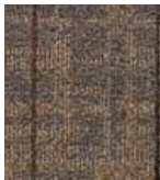
328 DISTORTED IMAGE