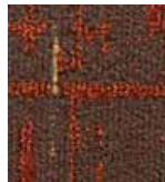
403 MORPHED ENERGY