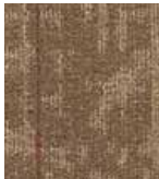
204 VISUAL STIMULATION