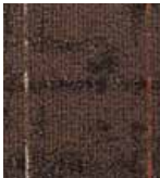
404 GLITCH ART