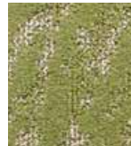
657 MAKE THE SCENE