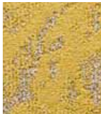
147 COME TO LIGHT