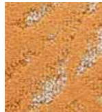
257 INTO SIGHT