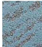
569 FLARE UP