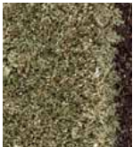
101 BUTTON DOWN

Style Number ..... GT011 Style Name ..... Shirt Modular Collection..... Menswear Construction ..... tufted Surface Texture ..... patterned tip shear Gauge ..... 5/64" (50.4/10 cm) Density ..... 7,660 Weight Density ..... 153,200 Stitches Per Inch ..... 10.1 per inch (39.76/10 cm) Finished Pile Thickness .094" avg (2.4 mm) Dye Method ..... yarn dyed Backing Material ..... EcoFlex ICT Face Yarn ..... Antron® Legacy nylon 6,6 with DuraTech Soil Protection by DuPont Fiber Technology ..... Duracolor® by LEES Stain Resistant System. Passes GSA requirements for permanent stain resistant carpet. Face Weight ..... 20 oz/yd2 (678.2 gm/m2) Size/Width ..... 24" x 24" (60.9 cm x 60.9 cm) Installation Method .... quarter turn, brick ashlar, vertical ashlar IAQ Green Label Plus.. 1098 Pattern Repeat ..... Not Applicable Warranties ..... Lifetime Limited Modular Warranty, Lifetime Duracolor Stain Warranty, Lifetime Static