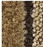
106 TAB COLLAR