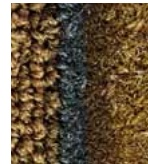
226 WATCH POCKET