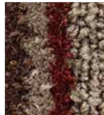
204 WAIST BAND