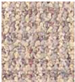
101 SPEAR GRASS

Style Number ..... DA986 Style Name ..... Sisalcraft II Construction ..... axonometric patented tufting Surface Texture..... textured loop graphics Gauge ..... 1/10" (39.4/10 cm) Density..... 6,353 Weight Density ..... 152,472 Stitches Per Inch..... 8.9 per inch (35.04/10 cm) Finished Pile Thickness .136" avg (3.5 mm) Dye Method..... yarn dyed Backing Material..... Unibond Flex Face Yarn ..... Antron® Legacy nylon 6,6 with DuraTech Soil Protection by DuPont Fiber Technology ..... Duracolor® by LEES Stain Resistant System. Passes GSA requirements for permanent stain resistant carpet. Face Weight..... 24.0 oz/yd2 (814 g/m2) Size/Width ..... 12' width (3.66 mm) IAQ Green Label Plus.. 4952 Pattern Repeat ..... 8" W x 8" L Warranties ..... Lifetime Limited Unibond Flex Warranty, Lifetime Duracolor Stain Warranty, Lifetime Static