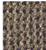
431 BALSAM FIR