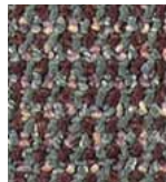
421 RAIN FOREST