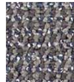
488 BAY BREEZE