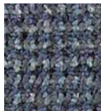
587 MIDSUMMER'S NIGHT