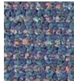
127 KENTUCKY BLUEGRASS