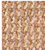
106 WILD RYE