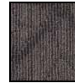
328 RODEO DRIVE