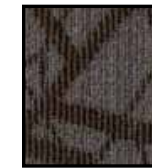
338 GLEN ECHO