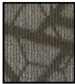
201 ANSLEY PARK