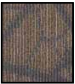
108 CANAL HOUSE

Style Number .....GT057 Style Name .....Weave Modular Collection .....Places and Spaces Construction .....tufted Surface Texture.....textured multi-colored cut and loop Gauge .....1/12 (47.00 rows per 10 cm) Density .....5,180 Weight Density.....103,600 Stitches Per Inch .....10.2 (40.16 per 10 cm0) Protective Treatment.....DuraTech Soil Protection by Invista Finished Pile Thickness .....139" (3.53 mm) Dye Method.....yarn dyed/solution dyed Backing Material .....EcoFlex ICT Fiber Type .....Antron® Legacy Nylon Fiber Technology .....Duracolor® by LEES Stain Resistant System. Passes GSA requirements for permanent stain resistant carpet. Face Weight .....20 oz/yd2 (678.2 gm/m2) Size/Width.....24" x 24" (60.9 cm x 60.9 cm) Installation Method .....quarter turn IAQ Green Label Plus.....1098 CRI Rating .....Heavy Traffic Pattern Repeat.....Not Applicable Warranties .....Lifetime Limited Modular Warranty, Lifetime Duracolor Stain Warranty, Lifetime Static