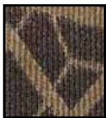
408 STONE MOUNTAIN