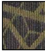
307 WATER TOWER BLUE