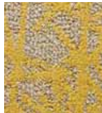
147 COME TO LIGHT