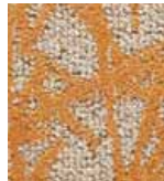
257 INTO SIGHT