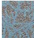
569 FLARE UP